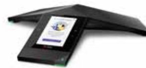
Poly Trio 8800

The Plantronics Calisto speakerphone family delivers high-quality audio solutions for small conference or huddle rooms and personal conferencing.