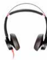
Plantronics Blackwire 7225