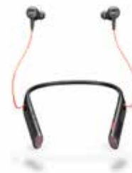
Plantronics Voyager 6200 UC

The Plantronics Blackwire family gives you a broad selection of corded UC devices that deliver outstanding audio quality and reliability, ease of use and price points to meet any budget.