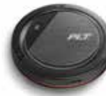
Plantronics Calisto 5200