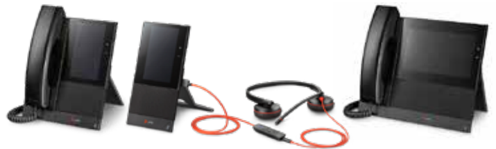
Poly CCX Series

Polycom VVX line offers solutions that are certified for Skype for Business, and connects to Microsoft Teams via a voice gateway.