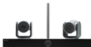
Polycom EagleEye Director II