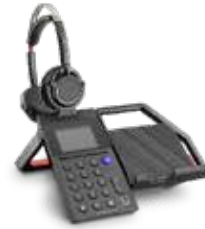
Poly Elara 60 Series