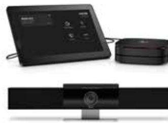
Poly Solution Bundles with HP and Lenovo Microsoft Teams Rooms

Polycom RealConnect for Microsoft Teams or Skype for Business provides video interoperability with standards-based video endpoints such as Polycom and Cisco, using Microsoft Outlook for scheduling, and enabling one-click join functionality. Now available as a cloud service or through on-premises collaboration infrastructure.